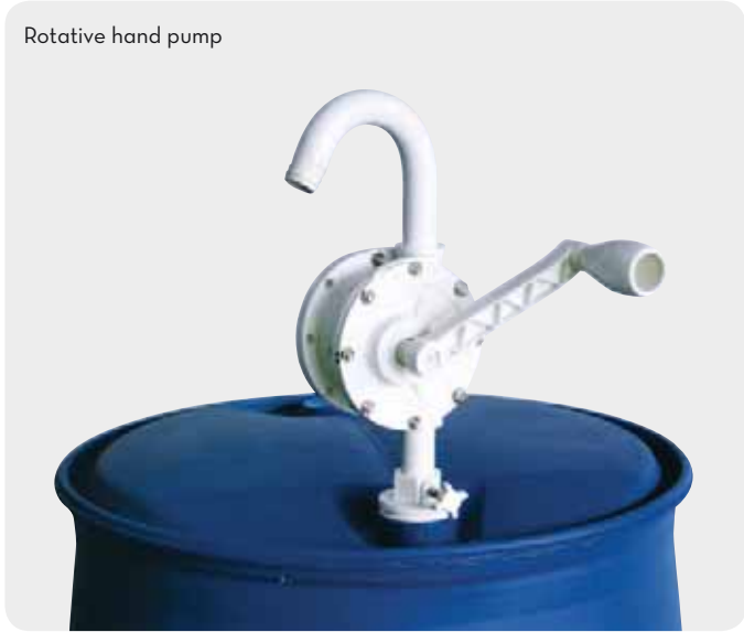
Rotative hand pump