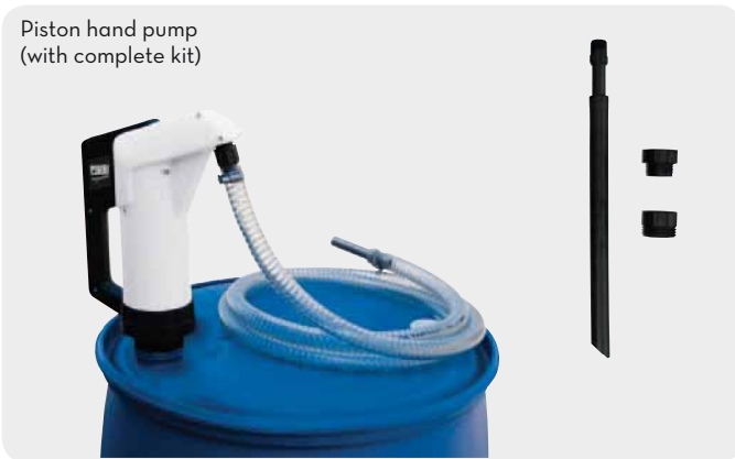
Piston hand pump (with complete kit)