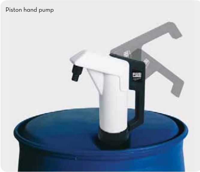
Piston hand pump